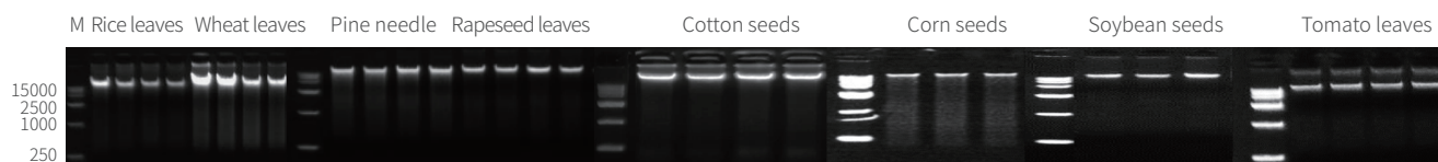
Figure 1 PAGE results of genomic DNA from different plant samples